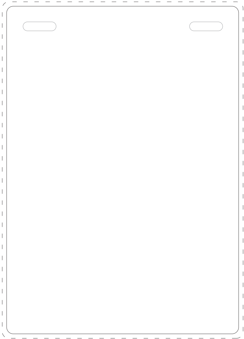
A6 105 x 148 mm Artwork 109 x 152 mm