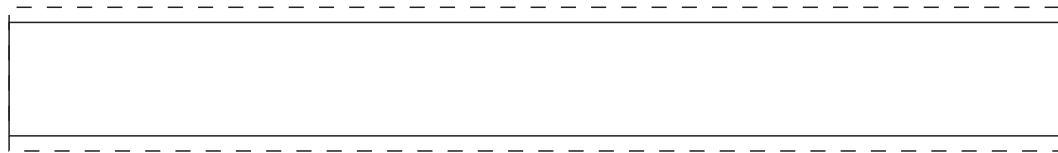
5.5" x 0.6" or 140 x 15mm Artwork bleeds 1/16" or 2mm

Packing the charity collection ribbons is one of the most labor-intensive work phases of the product. Since the ribbon packaging is partially automated, the exact attachment point of the campaign ribbons to the safety pin varies. Unfortunately, it is impossible to define the safety pin attachment position with millimeter accuracy; the attachment point varies. The end user must remove the safety pin to attach the campaign ribbon to a shirt.